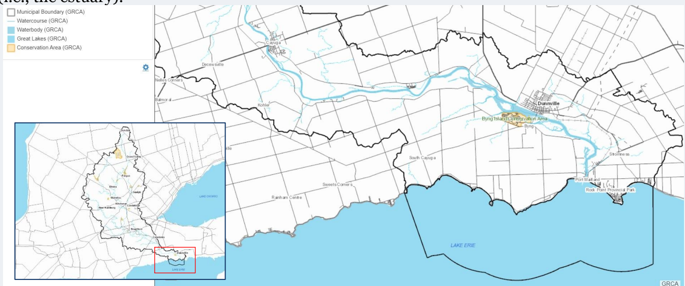
Figure 1. Study focus area on the north shore of Lake Erie's eastern basin. Map created using Grand River Conservation Authority's GIS tool.

The study area (Figure 1) is the lowest portion of the lower Grand River and nearshore Lake Erie (i.e., the estuary).